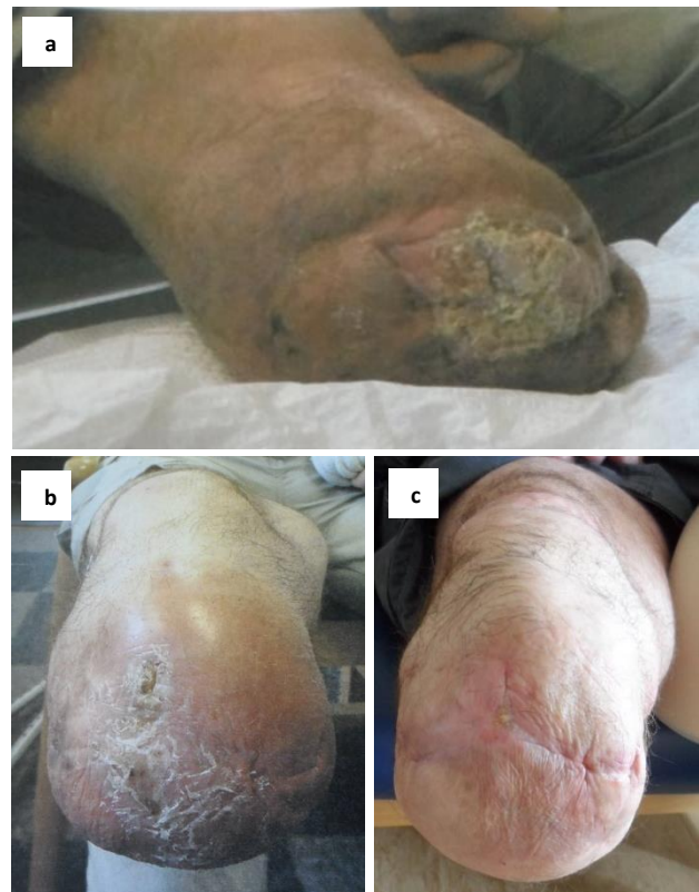
Figure 3: The condition of the Case #3 patient's residual limb (a) in its worst condition in 2011, (b) in 2013 and (c) in March 2019, after continued use of a perforated liner (since 2016) with elevated vacuum suspension and hydraulic ankle (since August 2017).

He was fitted with a perforated cushion liner, in conjunction with a passive vacuum, in 2016. In 2017 this was upgraded to an EVS system that used the movement of a hydraulic ankle unit to draw greater vacuum levels. After three months of using this prosthetic prescription, the patient reported that he thought it was “doing a great job” of keeping his skin dry; he was wound free and had had no residuum problems. The patient has continued to use this prescription for over a year, during which time his residuum remains in good health (Figure 3c).