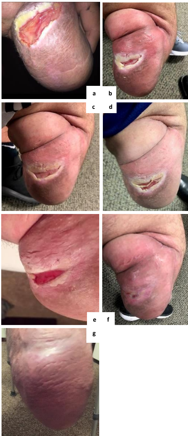
Figure 2: The condition of the Case #2 patient's residual limb (a) approximately one year before being fitted with a perforated liner, (b) at the point of fitting, and after (c) 4 weeks of use, (d) 7 weeks of use (the point of changing to passive vacuum suspension), (e) 9 weeks of use, (f) 11 weeks of use and (g) 13 weeks of use.