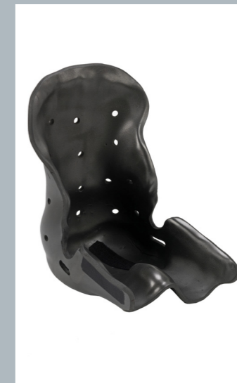
Removable liners for growth