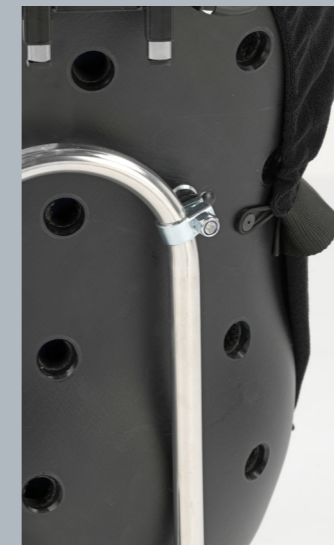
Undrilled support frame