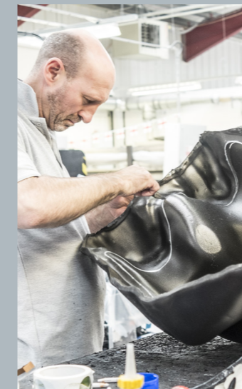
Hand crafted seat shell

Every quilted cover is made to the colour choice combination of the customer, manufactured from a pattern, created individually to match the unique shape of every seat. Made with 13mm thick padding to maximise comfort and provide a high quality finish.